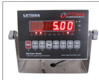
Built in Scale with Display