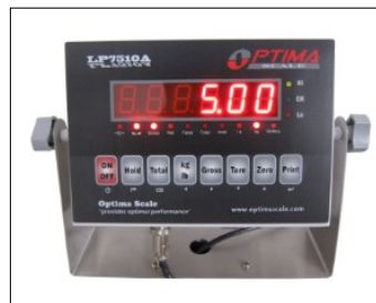
Built in Scale with Display