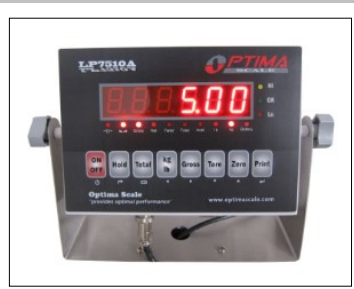
Built in Scale with Display