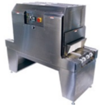
* Stainless Steel Frame Construction Available