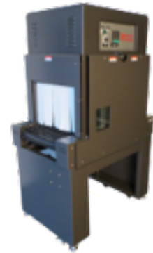
PP2212-48 and PP2216-48 Available for Taller Package Sizes