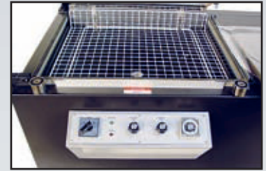
Dual Magnet Hold Down During Seal Cycle.

Now Available in 110 or 220 Volt For Higher Performance and Lower Operating Costs